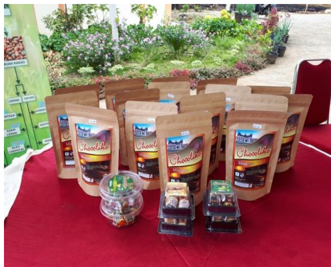
Figure 3: Several types of processed cocoa products produced by Guguak Agro Techno Park

been produced by Agro Techno Park Guguak include original 3 in 1 cocoa powder drinks, cocoa butter, original cocoa powder, cocoa powder, and various forms of chocolate candy with various flavors.