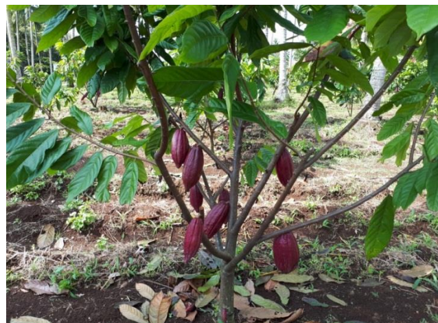
Figure 2: Demonstration of cocoa technology innovation in the Agro Techno Park Guguak area

Guidance through practice at the cocoa garden demonstration plot has greatly accelerated the process of adopting technological innovations for farmers. According to Rivky (2018), Haliatur (2019), Widiarso and Mubarakah (2019), Junaidi (2020), and Mamat (2020), the strategy for accelerating the adoption process of technological innovation is solving farmer problems through empowering farmers to get out of poverty and dependence so that can increase the per capita income of the farmers, this is not only changing farmers' farming patterns but also changing farmers' perspectives and behavior. The demonstration plot for cocoa technology innovations related to cocoa cultivation, such as cropping patterns, selecting quality seeds, fertilizing, controlling pests and plant diseases, and pruning cocoa plants are expected to increase the productivity of cocoa plants.