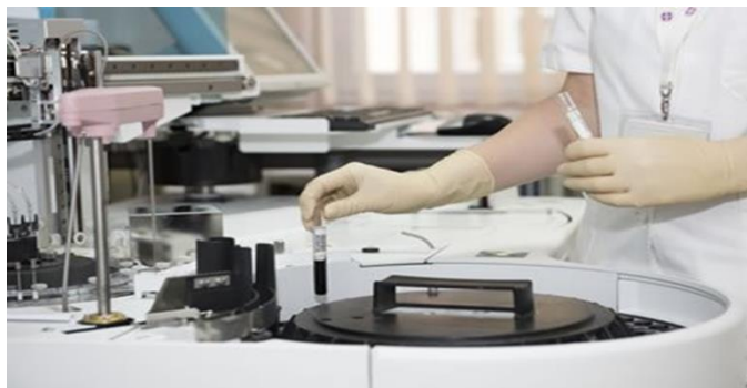
Figure 1: Picture of Automated laboratory water testing for quality evaluation (Sahu and Kumar, 2025).

More so, the assessment framework must incorporate creation of health-based targets and water safety plans. These elements offer a preventive and risk-based water quality management system that ensures testing systems are consistent with the goals of public health (Charles and O' Reilly, 2020). There should also be independent surveillance mechanisms to ensure that the laboratory testing systems are functioning well and to the desired standards. Such an intensive evaluation model will help laboratories to better track water quality and hence lead to a better health outcome of people and sustainable water management activities (Sani et al., 2025).