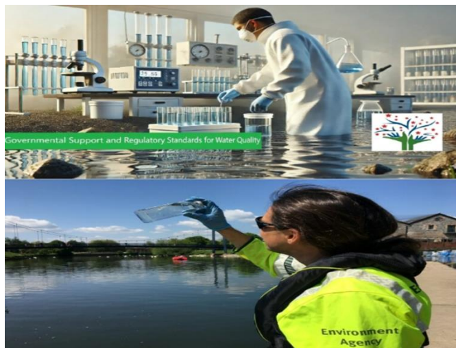
Figure 5: Picture of Government agencies monitoring and testing water to enforce quality standards and protect public health (Lopes et al., 2022).