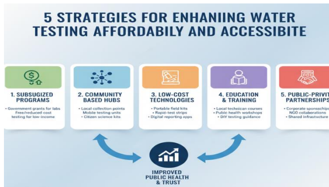
Figure 4: Diagram of Key strategies to make water testing more affordable, accessible, and community-centered (Sombei et al., 2025).

Figure 4 identifies the main points of making water testing more affordable and accessible through the combination of government action, community engagement, and innovation. This is through subsidized programmes that help to lower the financial costs to the low-income populations and community-based hubs and mobile units that take the testing services nearer to the places where people reside. Testing is also quicker and cheaper than it used to be because of low-cost technologies,