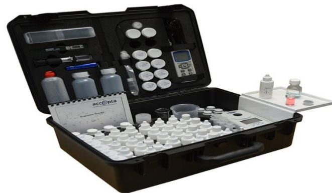
Figure 2: Picture of Simple water testing kits for preventing waterborne diseases (Kunz et al., 2024).

Figure 2 depicts a portable water testing kit, which is very important in preventing waterborne diseases as a result of frequent testing because it fastens and accurately detects any form of contaminant that is harmful like bacteria, chemicals and unhealthy pH. With the health workers, communities, and water providers being able to test the waters at regular intervals and at the location, potential risks would be detected early enough before people consume the polluted water in large quantities. This early identification assists in treatment, prevention of sources and corrective measures, and prevents outbreak of such diseases as cholera, typhoid, and dysentery. Frequent utilization of these types of testing kits thus enhances the proactive preventive actions of people in the community, and the drinking water turns out to be safe.